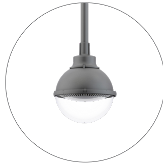
GO Dark grey