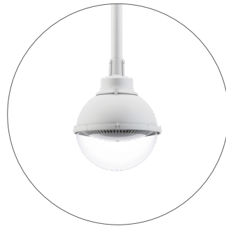
GC Light grey