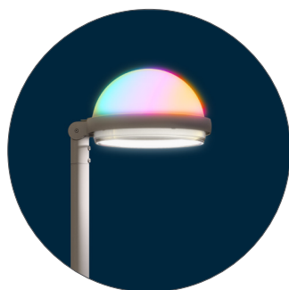
GC Light grey